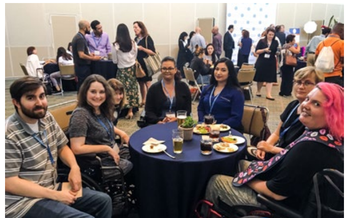
Patients and family members from around the world gather together at NDF's 5th Annual Symposium on GNE Myopathy