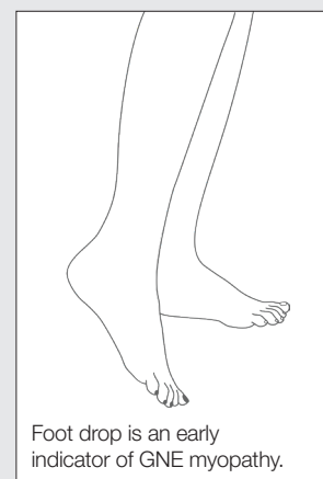
Foot drop is an early indicator of GNE myopathy.

Muscles of the upper extremities are involved within five to ten years after disease onset, causing difficulty raising arms above head and grip weakness. In later stages of the disease, patients may experience a complete loss of skeletal muscle function and require aid from caregivers for activities of daily life.